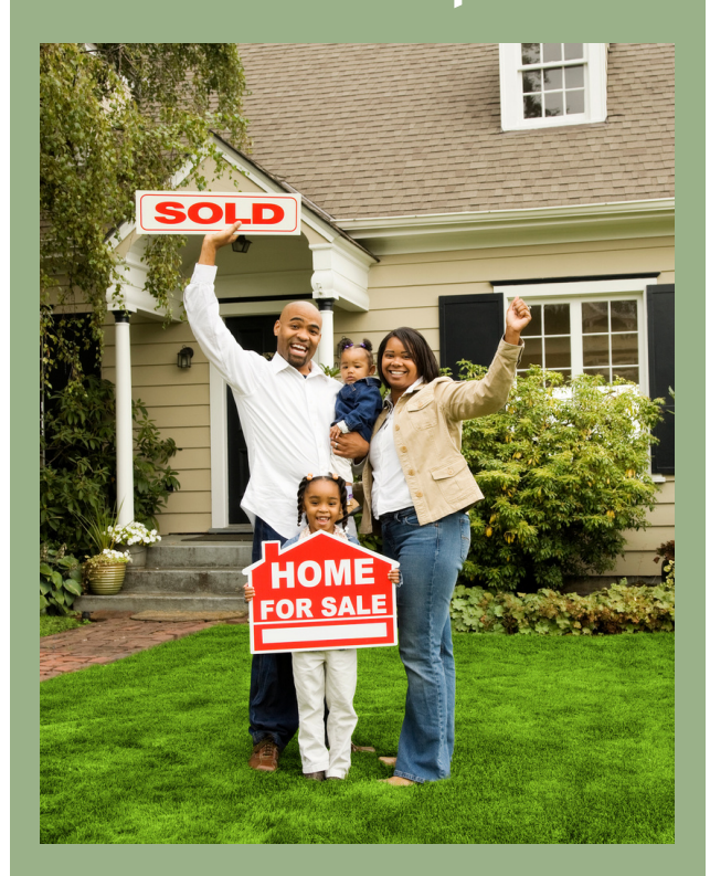
Click here to expolore our loans!